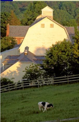
A cow grazes in a field near the Yellow Barn along Route 195.